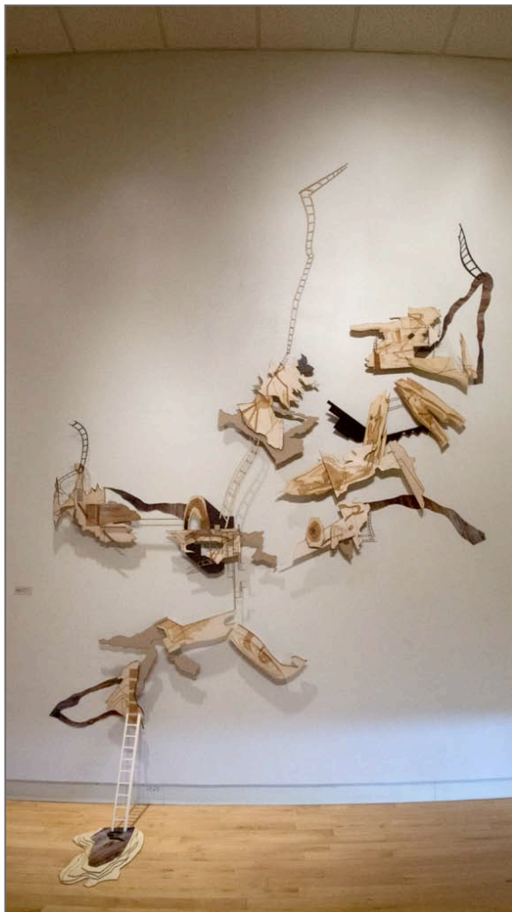
They Will Take You There by SooJin Hong; laser etching on wood and printed wallpaper.