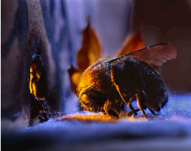
Atlas: Coming Home by Xavier Nuez; film photography (archival inkjet print).

The Attleboro Arts Museum gallery hours for “On the Threshold” are Tuesday – Saturday, 10 – 4pm. The exhibition will run from July 14 th – August 10 th , 2012. Admission is free; donations are always appreciated.