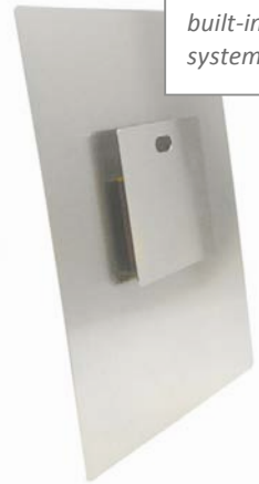
Aluminum substrate with built-in hanging system